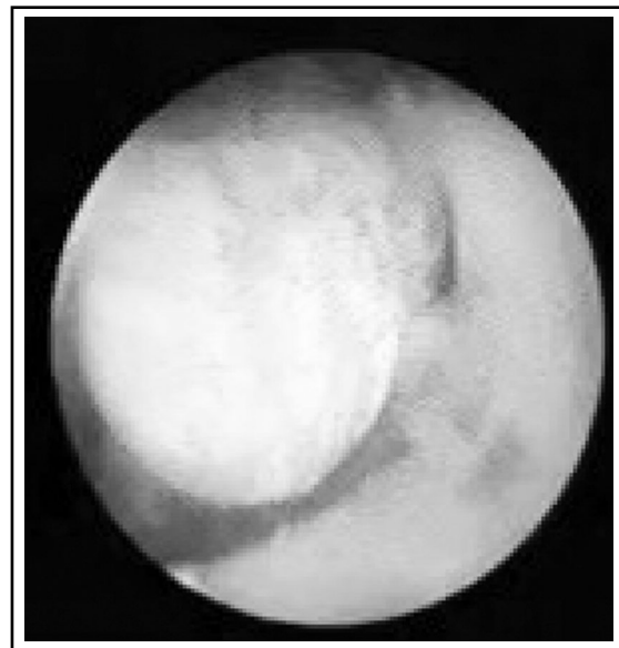
Fig.3: Stones were found by F4.8 visible puncture SMP.

Multiple renal calculi are common in clinical practice, with a low clearance rate when single-