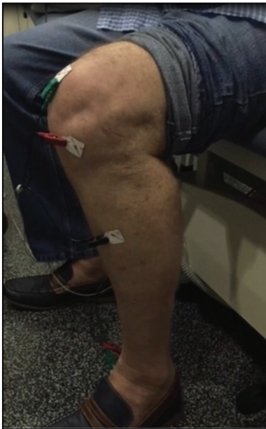
Video 1. Regular sound immediately after standing (helicopter sign) and disappearing with sitting down is a unique feature of orthostatic tremor.

and bilateral DBS electrodes (model 6146, St. Jude Medical, Plano, TX, USA) were implanted targeting the ventral intermediate nucleus (Vim) thalamus. After preoperative planning (Waypoint Navigator Software, FHC, Bowdoin, ME, USA) the final target was determined with intraoperative microelectrode recording and test stimulation (looking for the occurrence of side effects such as paresthesia) at several positions. No intraoperative testing of the actual effect of DBS was performed due to the tremor not being present in the supine position. The electrodes were connected to an implantable pulse generator (Brio rechargeable IPG, model 6788, St. Jude Medical). Postoperative localization of the active electrodes (computed tomography–MRI fusion) showed the active electrode (contact 3 cathodal; contact 1 anodal) to be 12 mm lateral, 6 mm posterior, and 3.5 mm superior to the mid-commissure point (MC) on the left and 12.6 mm lateral, 6 mm posterior, and 3.5 mm superior to the MC on the right (Figure 2).