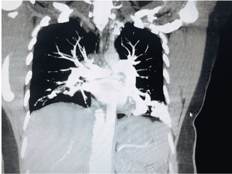
FIGURE 2: Coronal contrast CT image showing arteriovenous (AV) malformations

Coronal contrast reformatted CT image, set on the mediastinal window.