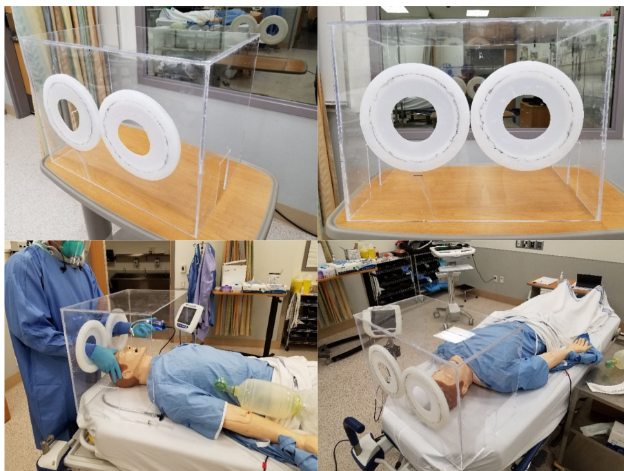
Fig. 1 Image of our simulation setup, including the design of our aerosol box.

Our primary outcome was the impact of the aerosol box on intubation time, defined as the time the video laryngoscope blade passed the teeth until confirmation of tracheal intubation via positive end-tidal CO 2 (ETCO 2 ) waveform using the mannequin's simulated capnography monitor upon initiation of manual ventilation.