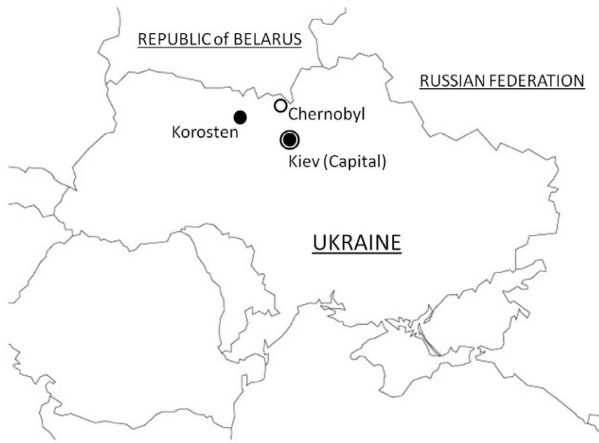
Figure 1. Location of Korosten, Ukraine relative to the Chernobyl Nuclear Power Plant (CNPP). doi:10.1371/journal.pone.0050648.g001

exposed to fallout from nuclear testing, or those exposed to emissions due to nuclear weapons production [5,6]. Also, Imaizumi et al. reported that among atomic bomb survivors in Hiroshima and Nagasaki, a significant linear dose-response relationship was observed for the prevalence of all solid nodules: not only malignant tumors, but also benign nodules and cysts [7]. Although these results suggest that both internal and external radiation exposure appear to increase the risk of development of thyroid nodules, prognosis in patients with benign thyroid nodules exposed to radiation, i.e., the possibility of “malignant transformation,” has not been evaluated.