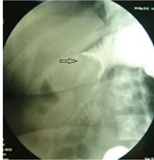
FIGURE 1: Double-contrast barium enema examination showing an ovoid filling defect (arrow) in the cecum and ascending colon.

Treatment options of colonic lipomas are various and include endoscopic and surgical procedures. Endoscopic resection is generally recommended for lipomas with a diameter smaller than 2 cm or pedunculated lipomas with thin stalk [6], as in these cases the risk of complications following endoscopic resection is considerably low. However according to Katsinelos et al., if a lipoma is sessile or broadly-based, even if its diameter is less than 2 cm, endoscopic removal is risky because the adipose tissue is an inefficient conductor for electric current and may result in a significantly high rate of complications like perforation or hemorrhage [7]. The majority of authors recommend surgery as the standard method of treatment for every colonic lipoma greater than 2 cm in size [3, 6]. Surgical treatment includes resection, colotomy with local excision, limited colon resection, segmental resection, hemicolectomy, or subtotal colectomy; the choice of any of the above-mentioned surgical interventions mainly depends on the lipoma size, location, and the presence or absence of definite preoperative diagnosis or disease complications [6]. During last years a few selected cases of successful laparoscopic