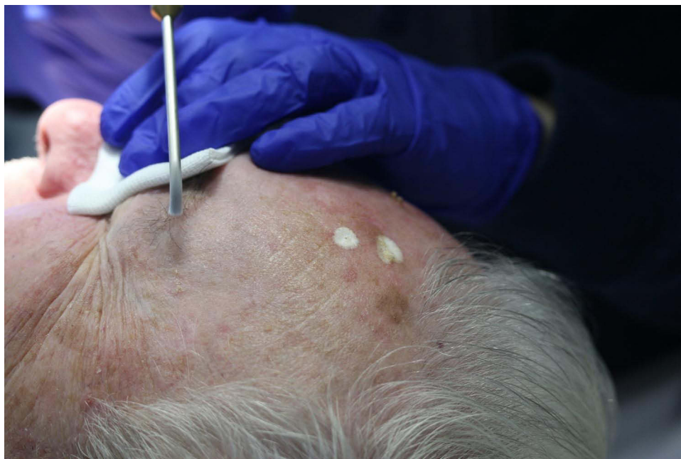
Figure 1 Cryotherapy LN spray technique for AKs of the face.

The freezing time should be adjusted according to the lesion to be treated. 18 Olsen's I–II AKs are generally treated with a freeze time between 5 and 20s and one freeze–thaw cycle. In case of larger and more hypertrophic lesions longer freeze time should be required. In a study of 92 patients with 5–50 AKs on the face and forearms, the use of two LN spray cycles of 5–10 s and a freeze margin of 1–2 mm induced a significant reduction in count and lesion size. 19 Longer