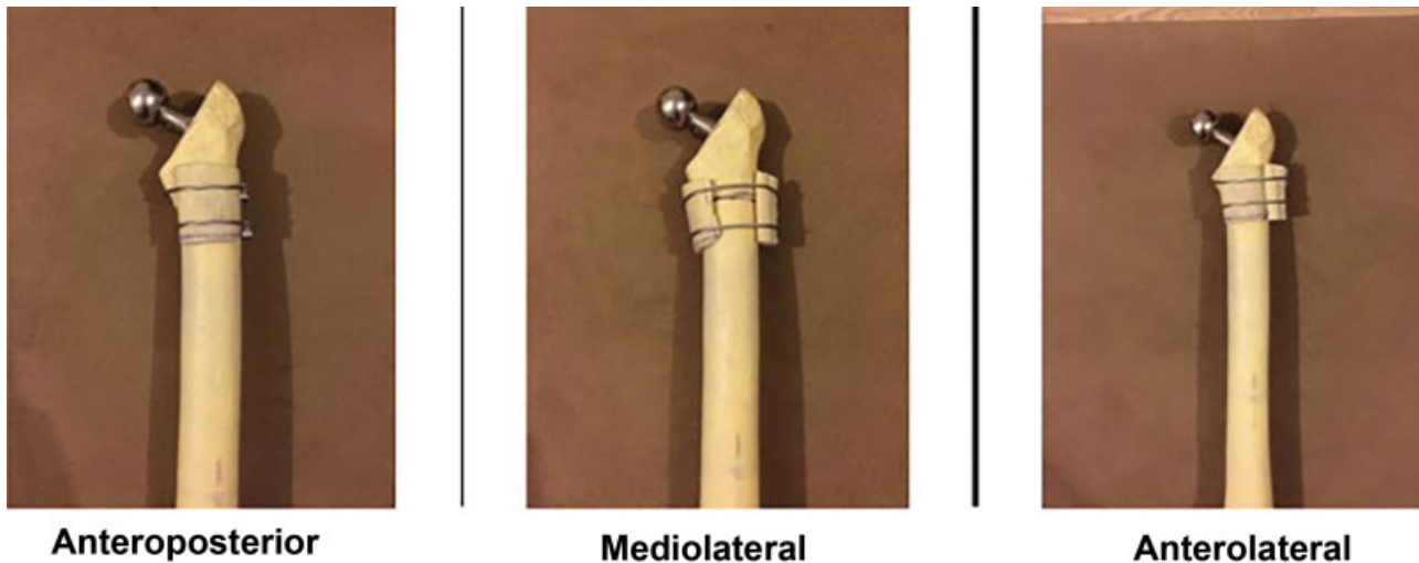
Fig. 1 Positions of the graft: anteroposterior, mediolateral and anterolateral.

anteroposteriorly, mediolaterally and anterolaterally, centering the osteotomy side, and fixed with cables around each composite bone (► Fig. 1 ). This procedure was repeated for each bone according to the type of osteotomy of the group.