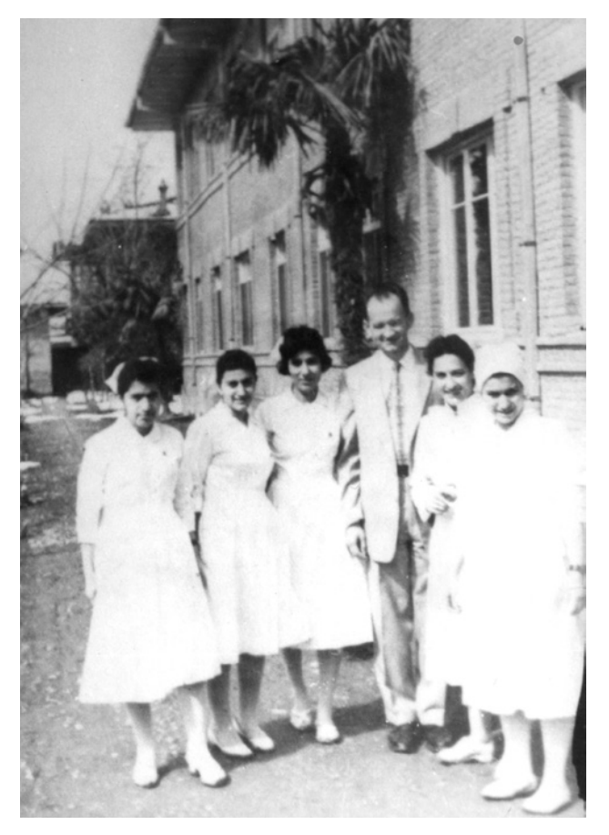
Figure 2. Dr. John Davidson Frame and nurses in front of American Hospital in Rasht [5] (Reproduced with permission).

transcriptionally activated pro-inflammatory cytokines and growth factors. The entire complex is referred to as cutaneous radiation syndrome and its severity depends on several factors such as the radiation dose, radiation quality, individual radiation sensitivity, the extent of contamination and absorption and amount of skin exposed [6]. Clinical manifestations usually include a combination of hyper- and hypopigmentations, epidermal thinning and sclerosis (Figure 3).