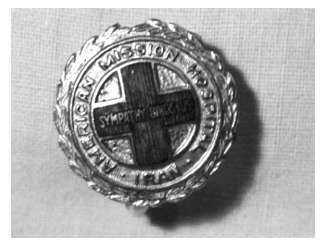
Figure 1. Medallion of American Mission Hospital in Iran [5] (Reproduced with permission).

Guilan is a province located in northern Iran, nowadays with a population of around three million. Guilan, with its