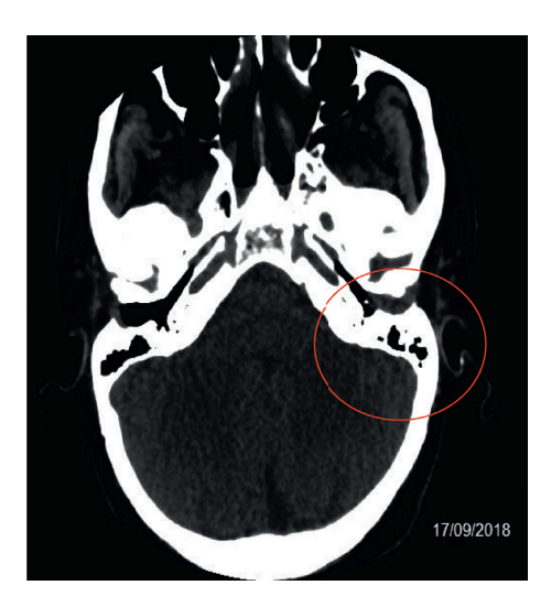
FIGURE 1: CT of the left ear without contrast medium.