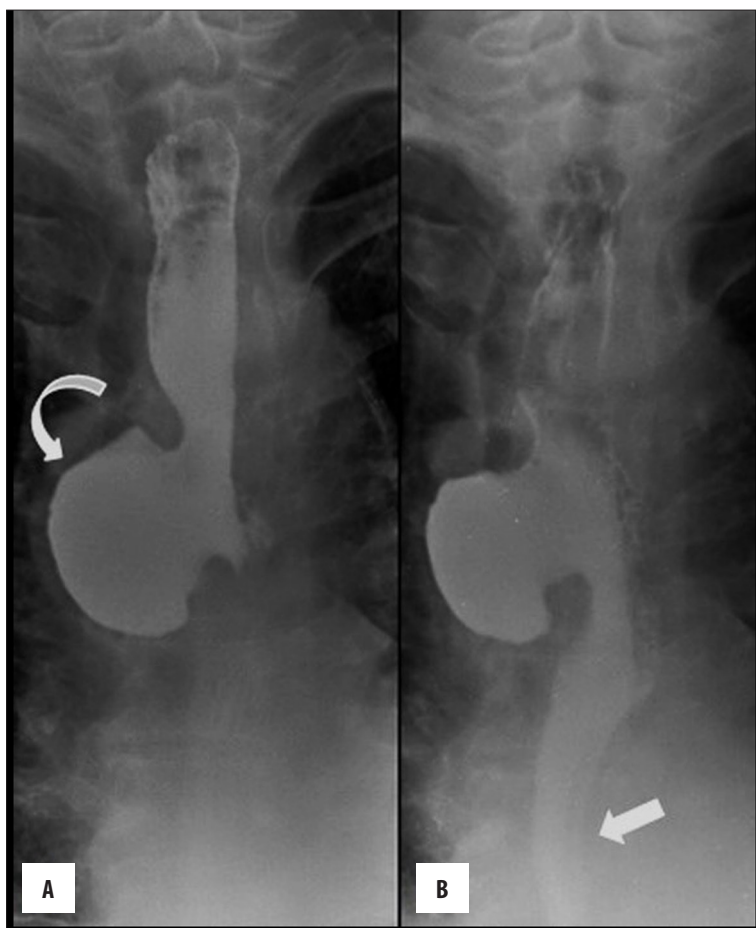
Figure 2. (A, B) Barium swallow showed large diverticulum arising from right lateral wall of mid esophagus (curved arrow) with normal appearing distal esophagus (solid arrow).

Mid-esophageal diverticulum with a large neck arising from the right lateral wall was visualized in upper GI contrast series (Figure 2A, 2B). Chest CT showed a diverticulum at the level of tracheal bifurcation with particulate