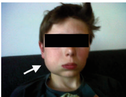
Figure 1. Photograph of the boy at the time of the swelling (white arrow).

ESR, erythrocyte sedimentation rate; Hb, hemoglobin; CRP, C-reactive protein; ANA, anti-nuclear antibody; ENA, extractable nuclear antigens antibody; IgE, Immunoglobulin E; IgG, Immunoglobulin G; IgM, Immunoglobulin M; EBV, Epstein-Barr virus; CMV, cytomegalovirus; ORL, otorhinolaryngology.