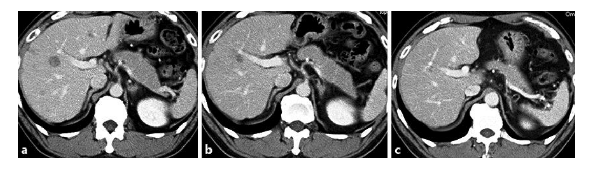
Fig. 2. Enhanced abdominal CT findings. a At baseline. Hypoenhanced tumors showed in segment 5 of the liver. b About 3 years later. The liver tumors have gradually decreased in size. c About 5 years later. The liver tumors have almost disappeared.

Kobayashi et al.: Sorafenib Monotherapy in a Patient with Unresectable Hepatic Epithelioid Hemangioendothelioma