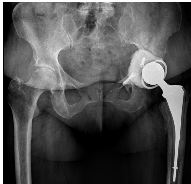
Figure 2. Anteroposterior view of the pelvis showing the spacer construct and the femoral stem.

The patient was treated with 6 weeks of intravenous antibiotics, followed by a 2-week antibiotic holiday at which time repeat serology and hip aspiration was performed. Cultures from the aspiration were negative with 5.3% neutrophils and a white blood