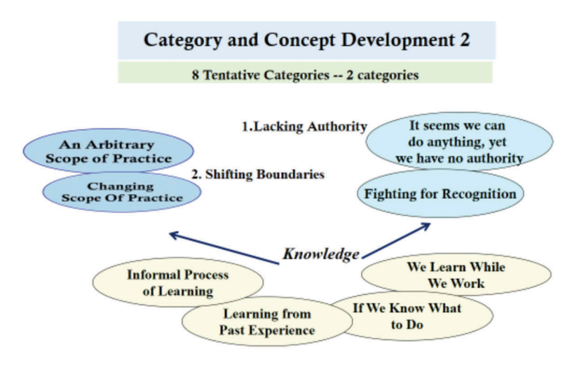
Figure 2. Concepts development.

under research; in this research it was maintained by implementing the GT method from Charmaz (2009, 2014), which is grounded in pragmatism and social constructionism.