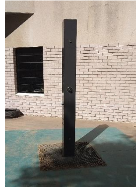
Image 2. Fountain for playing and cooling