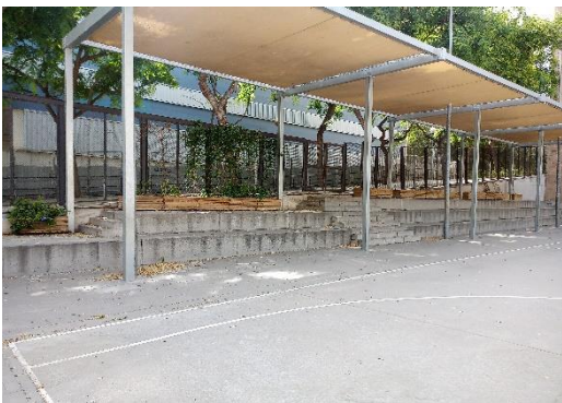
Image 5. Canopy located in a seating area next to the sport court