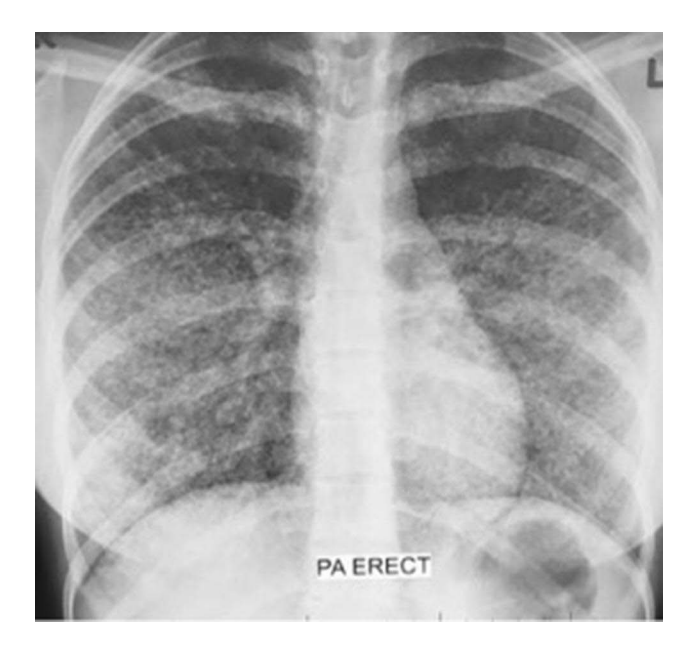
Figure 2 Anteroposterior chest radiography demonstrated diffuse reticulonodular opacities (nodular> reticular) involving the bilateral hemithorax with background ground glass haziness.

hemoglobin level of 8.5 g/dl and mean corpuscular volume of 67fL. Her platelet levels were normal at 300 \times 10^{3}/\mu L . Renal and liver biochemistry were within limits. Her blood group was B rhesus D positive. The urine lipoarabinomannan (LAM) was positive (Grade II) (Figure 1). Chest radiography revealed features of miliary tuberculosis with background ground glass opacities (Figure 2). Unenhanced computed tomography of the brain demonstrated a right sided large geographic area of hypodensity (19-25 HU) involving the right frontoparietotemporal cortex in the territory of the right middle cerebral artery with an associated hyperdense middle cerebral artery sign (Figure 3A and B). Sputum and blood samples were taken off for GeneXpert and cultures, respectively. The GeneXpert was positive without rifampicin resistance. Anaerobic, aerobic, fungal and mycobacterial cultures were negative. CD4+ T-cell count was 32 cell/microliter and HIV RNA viral load was unknown. Her urine human chorionic gonadotrophin was negative.