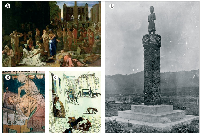
Figure 2: Examples of modern and historically important emerging infectious diseases

Although smallpox may have first emerged in central Africa 5000 years previously—when an animal orthopoxvirus jumped into human beings 48 —the disease had probably not reached the New World. Historians believe that about 3.5 million people in central Mexico died in the first year of the hueyzahtl . By the end of the century some 18.5 (74%) of the 25 million population