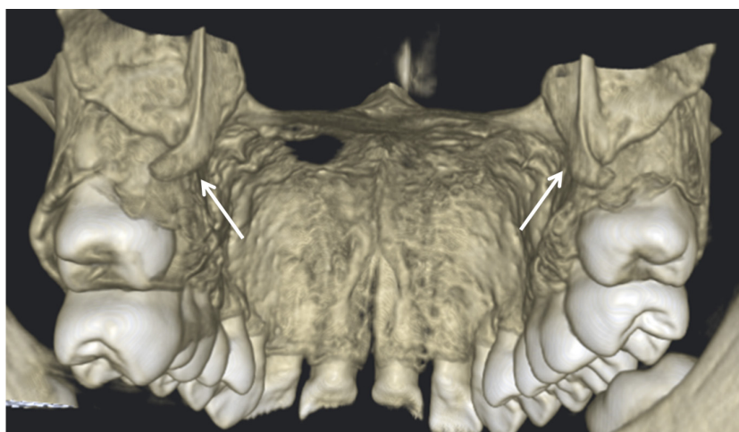
Figure 2. CBCT scan disclosing the presence of elongation of the pterygoid hamulus with acute bending of the pterygoid hamulus to protect the tensor veli palatine tendon.