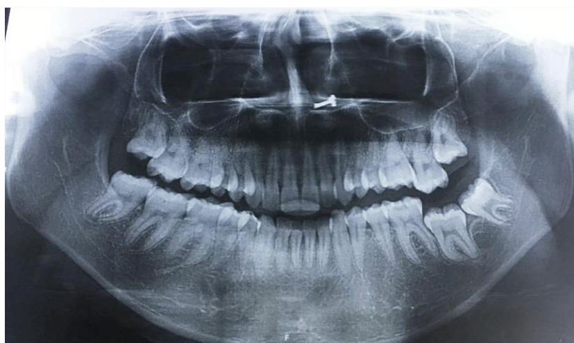
Figure 1. Panoramic radiograph revealing possible elongation of pterygoid hamulus.

An anatomic review using a CBCT scan disclosed the presence of elongation (Figure 2) with acute bending of the pterygoid hamulus to protect the tensor veli palatine tendon. A diagnosis of Pterygoid Hamulus Syndrome was made due to the drastic improvement in the patient's symptoms as a result of corticosteroid therapy.