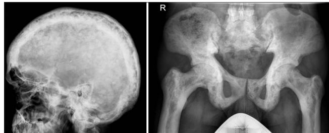
Figure 2: X-ray skull and pelvis of a subject showing sclerotic and lytic lesions characteristic of Paget's disease

Paget's disease is an uncommon metabolic bone disease in India, and in the present study, we sought to analyze the changing trends in its presentation and management over the past one decade. More than half of the study participants had presented in the seventh decade of life. Over one-third of the participants were women. Although the most commonly reported symptoms were low backache and bony pains, about one-fifth of our participants were asymptomatic at diagnosis. About 60% of our patients had received parenteral zoledronic acid and all our patients showed response to treatment.