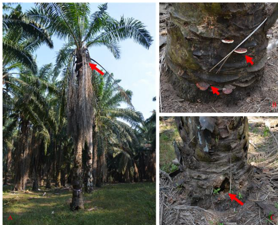
Fig. 2. A) BSR infected matured oil palm tree at the final stage of infection. The lower leaves collapse in old palms hanging downwards vertically from the point of attachment to the trunk that makes a skirt-like appearance (arrow). B) Distinctive basidiocarps at the base of the oil palm trees (arrows); C) Disintegrated stem base eventually turning hollow within at advance stages of infection (images are from a personal collection of Dr Yuvarani Naidu, Malaysian Palm Oil Board).

The fungus colonizes the cortex, endodermis, pericycle, xylem, phloem and pith of the palm (Rees et al., 2009) and it may be observed as a whitish skin-like layer on the inner surface of the exodermis in older roots. Roots are often found completely dead and colonized by many saprophytic micro-organisms, as they are often infected before foliar or stem lesion symptoms are observed. Basidiomata frequently appear along the entire trunk once the