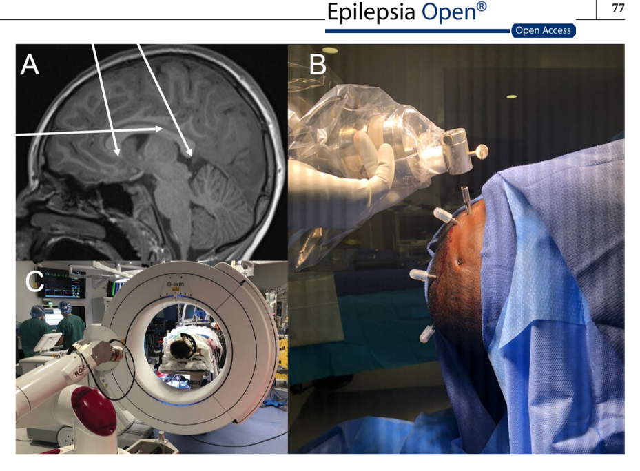
FIGURE 1 A, Example of a preoperative planning photo using T1weighted MRI to visualize LITT catheter trajectory to target the genu, isthmus, and splenium of the corpus callosum. B, Example of capped intraoperative electrode catheters. C, ROSA robot and O-arm intraoperative imaging system. Not visualized is the Leksell stereotactic system head frame, which is preferred for LITT callosotomy for its flexibility

guidance bolt along the planned trajectory and MRgLITT is performed under direct MR thermography. The ROSA robot navigates to each subsequent trajectory, and this process is repeated for each trajectory. Imaging is obtained to assess tissue changes and successful ablation of fibers (post-contrast MPRAGE, T1, and DWI). Once acceptable ablation has been achieved, the patient is taken to OR where ablation bolts are removed and sutured.