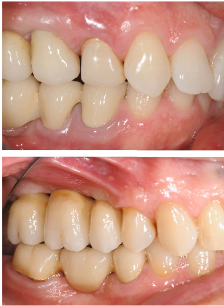
FIGURE 1: Peri-implant mucositis of the 1.5 and peri-implantitis of the 1.7.

using monolithic or partially veneered zirconia. CAD/CAM procedures and digital workflow are now common in daily clinical practice because of their excellent results in terms of use and quality obtained [21].