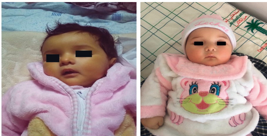
FIGURE 2: After 3 months of follow-up, the jaundice disappeared completely.

white blood cells were 12400/\text{mm}^3 , CRP was 18 \text{ mg/l} ( <6 ), and urine cytobacteriological examination showed a urinary tract infection with Klebsiella pneumoniae , and she had been treated successfully, but jaundice persisted.