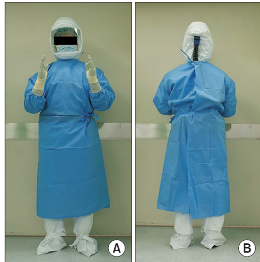
Fig. 6. After surgical hand scrubbing, a surgical gown and additional gloves were worn for the index surgery. (A) Front view. (B) Back view.

the OR in a negative-pressure carrier isolator accompanied by the transport team. Spinal anesthesia was performed to prevent contamination of the anesthesia equipment and patient aggravation. After appropriate positioning, additional surgical hand preparation was performed over PPE with the use of a sensor-activated surgical hand disinfectant dispenser (isopropanol 65%, N-propyl alcohol 15%, and polyhexamethylene) (Fig. 5). Then, a surgical gown and additional gloves were worn (Fig. 6). After operation, the surgical staff transferred the patient to the transport