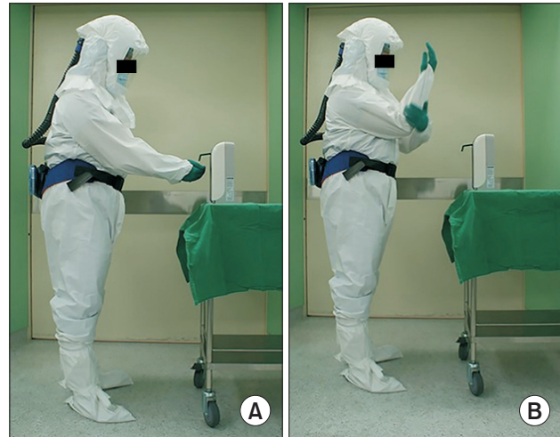
Fig. 5. After appropriate patient positioning, additional surgical hand preparation was performed over personal protective equipment with the use of a sensor-activated surgical hand disinfectant dispenser (isopropanol 65%, N-propyl alcohol 15%, and polyhexamethylene).

In the OR, the surgical staff received the patient and performed anesthesia when the patient was brought into