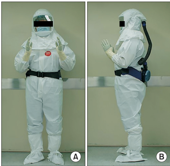
Fig. 4. In the preparation room, all surgical staff wore waterproof, full-body, protective clothing including boots and a powered air-purifying respirator system, which drew clean air through a high-efficiency particulate air filter was used to ease breathing. (A) Front view. (B) Lateral view.