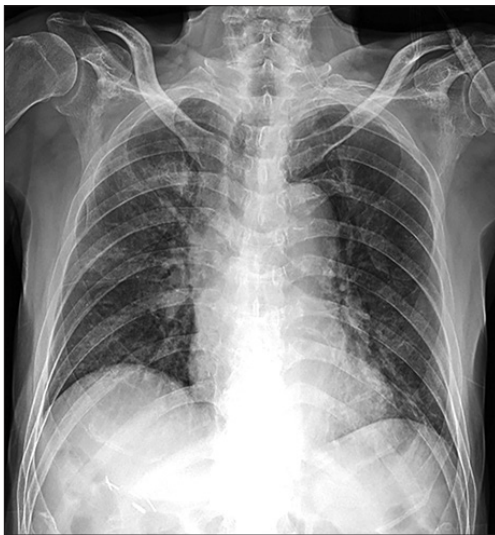
Fig. 1. Anteroposterior chest radiograph obtained on March 26, 2020 (hospital day 1), showing diffuse peribronchial infiltration in the parenchyma of both lungs.

diabetes mellitus, chronic obstructive pulmonary disease, and Alzheimer's dementia and was only capable of indoor activities before the injury. After the fall, the patient complained of right hip pain, but no radiological examination was done. Since February 18, 2020, there has been a rapid increase in the number of confirmed cases of COVID-19 in the Daegu region and cases of mass infection occurred in that facility. Nasopharyngeal swabs for COVID-19 detection were performed on all hospitalized personnel. The patient was confirmed positive for COVID-19 one day after the fall. He was transferred to a local COVID-19 treatment-designated hospital and was diagnosed with a right femoral neck fracture. However, the hospital was not prepared to perform orthopedic surgery for patients with COVID-19.