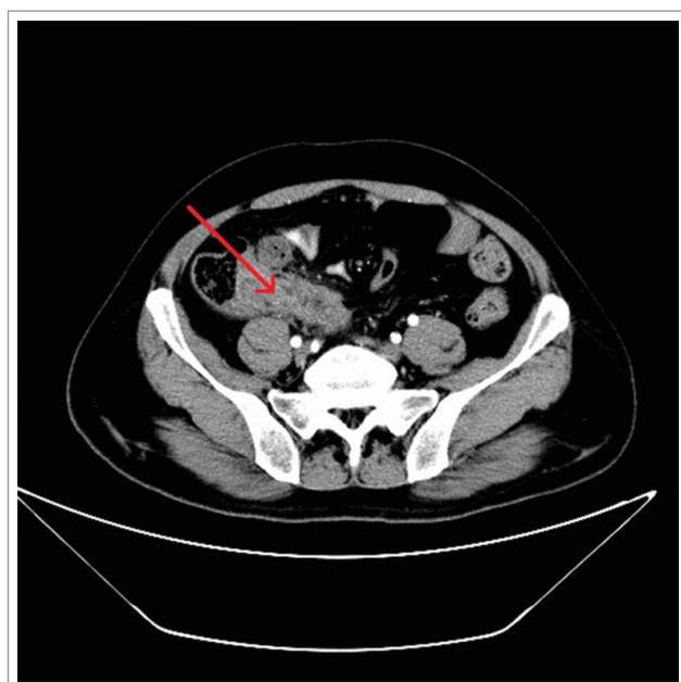
Figure 2. CT scan of abdomen demonstrating a swollen appendix with an unclear border, uneven density, and heterogeneous enhancement is visible (arrow).

The chemotherapy associated with local treatment (radiotherapy or surgery) could be used as standard therapy for SCC of the esophagus. Casas et al concluded that multimodality