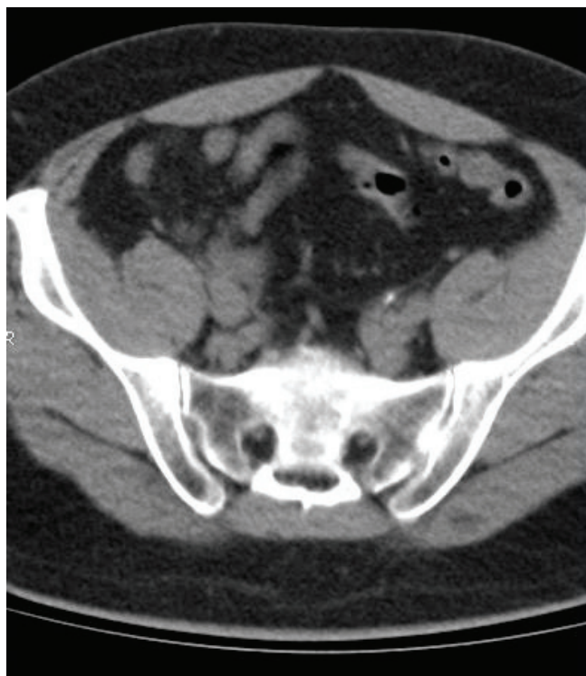
Figure 1. Abdominal CT revealing a 9-mm hyperdense image in the left ureter topography.

Blood urea nitrogen and creatinine were within limits of normality; the rest of laboratorial analysis was unremarkable, except for mild leucocytosis of 12,000/ \mu L, microhematuria, pyuria (10 leucocytes/field) and presence of crystals at urinalysis. An ultrasonography was performed and revealed mild hydronephrosis bilaterally. A non-enhanced computer tomography (CT) was then performed and showed a 9-mm hyperdense image in the left ureter topography along together with a 8-mm hyperdense image in the right ureter topography (Figures 1 and 2). The diagnosis of bilateral ureterolithiasis was then established.