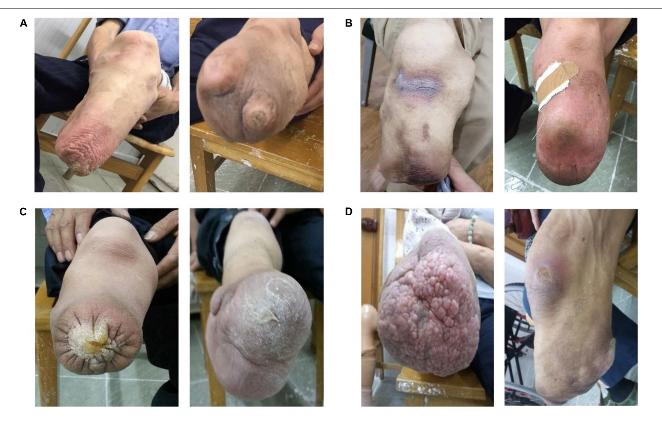
FIGURE 2 | Representative clinical lesion manifestations and patient distribution of ASSD. (A) Stump tinea corporis with fungal infection of Trichophyton rubrum (left) and Aspergillus (right). (B) Intertriginous dermatitis (left) and eczema (right). (C) Cutaneous keratosis. (D) Verrucous hyperplasia (left) and skin ulceration (right).