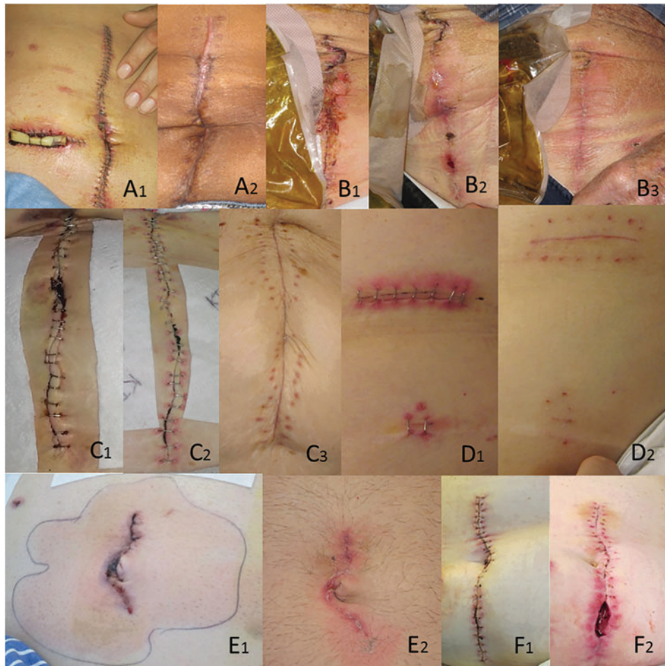
FIG. 1. Examples of incision images demonstrating diverse photographic data on patients who exhibit normal incision healing, as well as those who experience complications of incision healing. Patients are labeled A–F with numbers representing sequential images of the same incision over time. Color image is available online.

extremes would be easy to manage and dichotomized into “no therapy” versus “intervention” (incision opening and/or antibiotics). Scores in the middle, for example in the 20%–80% probability of infection range, would doubtlessly generate management algorithms, probably incorporating some form of re-evaluation, re-imaging, laboratory studies, or radiologic imaging.