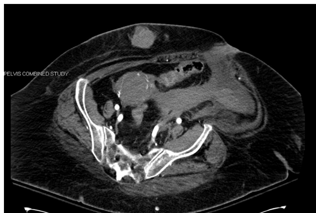
Figure 1. Left external iliac artery pseudoaneurysm with active extravasation and moderate sized hematoma extending into extraperitoneal pelvis. Malrotation of the pelvis noted while patient was positioned flat on the table for CT imaging.

Within 30 minutes of arrival to the PACU, the patient became hypotensive requiring fluid resuscitation and vasopressors. In the 2 hours that followed, she remained hypotensive, tachycardic, oliguric, and became hypoxemic, requiring intubation. Hematocrit returned as 22%, and blood products were emergently ordered. A CT angiogram of abdomen and pelvis revealed left external iliac artery pseudoaneurysm with active extravasation of contrast and moderate sized hematoma extending into extraperitoneal pelvis, as shown in Fig. 1. A graft stent was promptly placed in the left external iliac artery by Interventional Radiology.