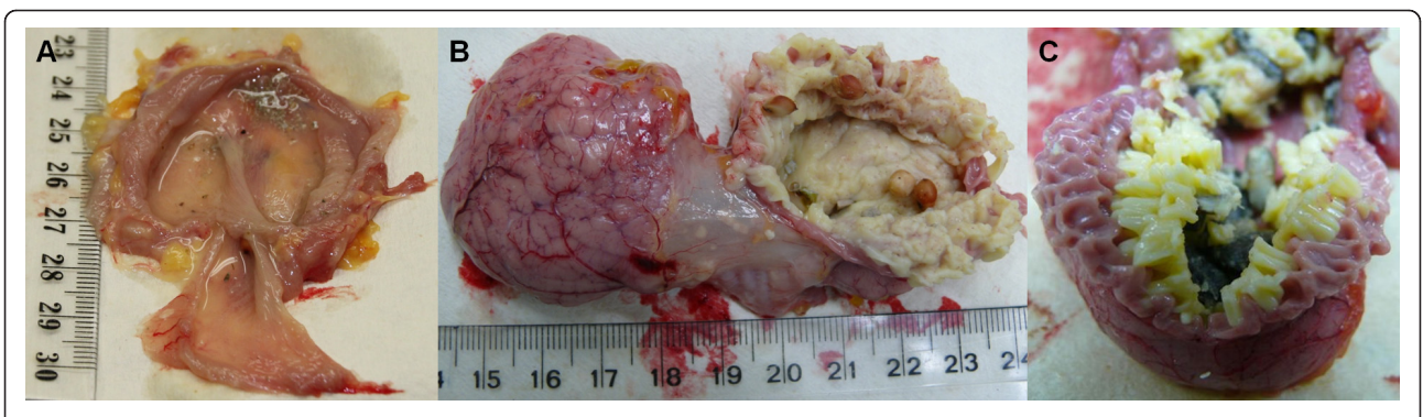
Figure 1 Macroscopic appearance of the pigeon crop sac . The non-'lactating' crop (A) has a completely different appearance to that of the 'lactating' crop (B). The lactating crop is more than twice the size of the non-'lactating' crop, with a thickened wall and two very obvious lateral lobes. When the 'lactating' crop is opened the pigeon 'milk' is seen as a bed of close-packed discrete rice-shaped pellets that are closely associated with the mucosal surface of the tissue (C). In contrast, the non-'lactating' crop is undifferentiated with minimal surrounding vasculature.

Near the luminal surface of the crop, the nutritive layers within each microscopic fold of epithelium began to coalesce, forming a parakeratinised layer. Macroscopic folds of the epithelium then resulted in fusion of large tracts of this parakeratinised layer, the end-result