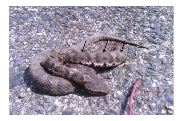
Figure 1. Mamushi ( Gloydius blomhoffii ). The characteristic pattern of hole coins (chains) on a Mamushi (arrows).