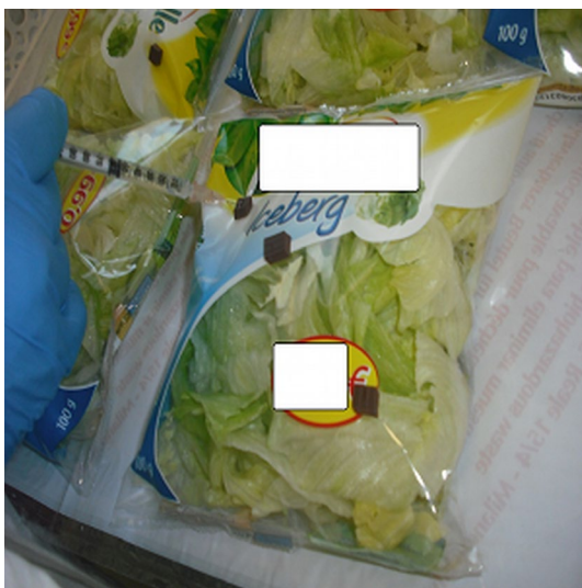
FIGURE 1 Contamination with septum method in 3 points

Contamination of the packages was done accordingly with the Guideline of the European Reference Laboratory for L. monocytogenes (EURL, 2014). The contamination was performed with the septum method; three points (Figure 1) of inoculation were identified, and on each point, a rubber septum was placed. The contamination of the packages was carried out with a syringe, distributing 1 ml of mixed bacterial suspension (0.3, 0.3, and 0.4 ml to a 1% of the weight of the products). Each septum was then sealed with another septum to assure the closure of the hole of the package. To ensure homogeneous contamination within the product, the packs were shaken manually for 1 min. Equal amount of saline water (IZSAM) was injected in control samples.