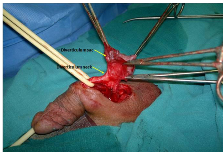
Figure 2 Complete exposition of the diverticulum and its neck (arrows) located in the peno-scrotal region.

of urethral diverticulum may be delayed because of the non-specific lower urinary tract symptoms. Patients may complain of recurrent urinary tract infections, pelvic pain, incontinence, post-void dribbling, dysuria (burning or pain with urination), urinary frequency and urgency, nocturia, or feeling of incomplete bladder emptying [4]. The diverticulum could present as a perineo-scrotal mass if the size is extremely large. In differential diagnosis of a scrotal mass in a male with paraplegia, especially when a urinary tract infection is observed, epididymo-orchitis and urethro-scrotal abscess should also be suspected. Retrograde urethrography is the best diagnostic technique to confirm and characterize the diverticulum [5]. However,