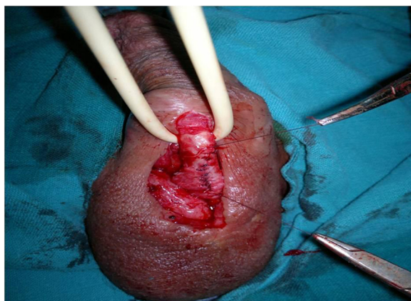
Figure 3 Urethroplasty performed following diverticulectomy.

Goyal et al. [6] have used transrectal sonography to diagnose congenital urethral diverticulum, but there is no recommendation of its routine use for acquired urethral diverticulum. Magnetic resonance imaging (MRI) is also useful because it can inform of the extent of the diverticulum, and of the involvement or not of the adjacent spongy tissue.