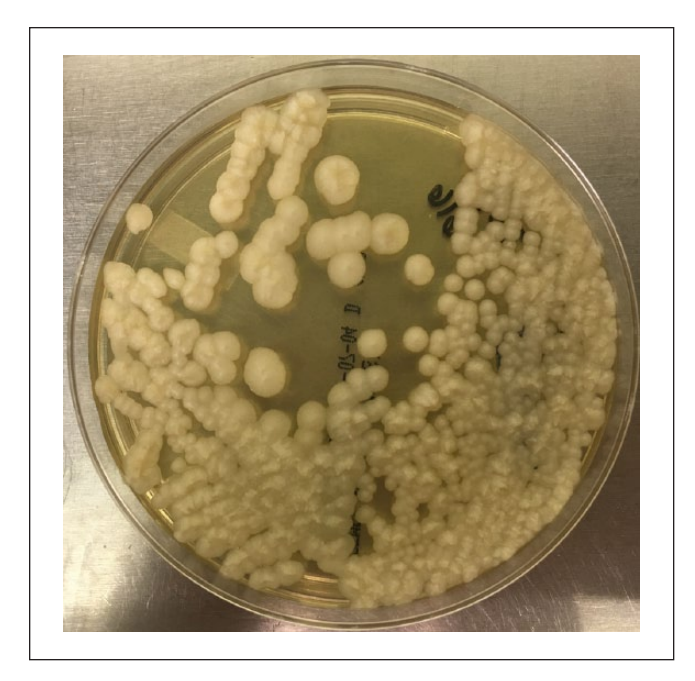
Figure 1. Magnusiomyces capitatus, peritoneal fluid, 5-day culture on Sabouraud Dextrose Agar, Emmons media (Thermo Scientific, Remel, Lenexa, KS).