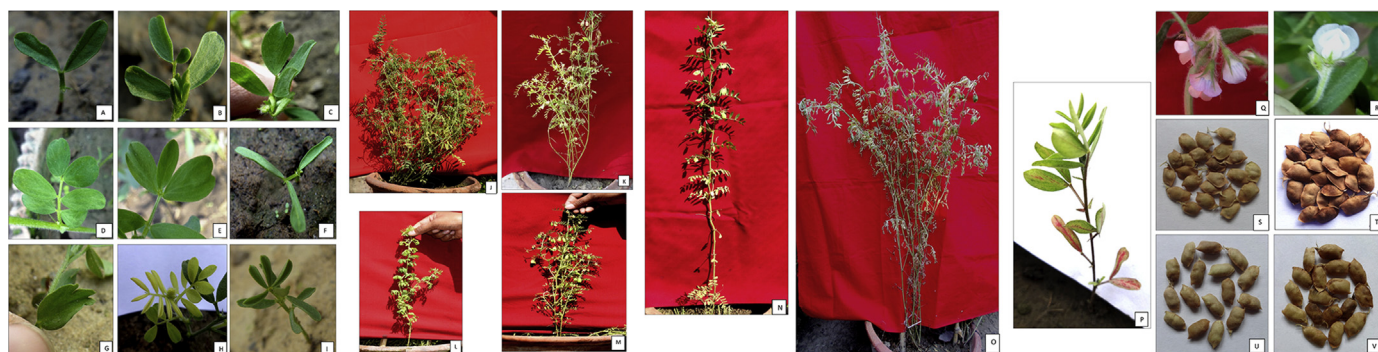
Plate 1. Induced phenotypic diversity of mutagenized population of Lens culinaris , A: bifoliate, oblong, vegetative leaf, B: two unequal size leaf one is large another is small, C: bilobed (unequal) thick, apical leaf, D: opposite leaf, E: heart shaped leaf, F: trifoliate, oblong shape with entire margin leaf, G: trilobed, H: chlorophyll mutant, I: tetrapartite leaflet, J: bushy mutant, K: one sided branch mutant L: curl leaf mutant M: dwarf mutant N: single branch mutant, O: tall mutant, P: mutant with deposition of anthocyanin, Q: three flower, R: single flower, S: small pod, T: medium and bold pod, U: large pod, V: very large and bold pod.

(Plate 1, C). Mutant bearing bilobed leaflet had large leaflets, pods and seeds. It obtained at 25 ppm lead and 15, 20 ppm cadmium nitrate. Mutagenic frequency of bilobed leaflet was 3.6 % and 3.2 % in lead and cadmium nitrate respectively. Total frequency of this mutant was recorded 6.8 % (Table 2).