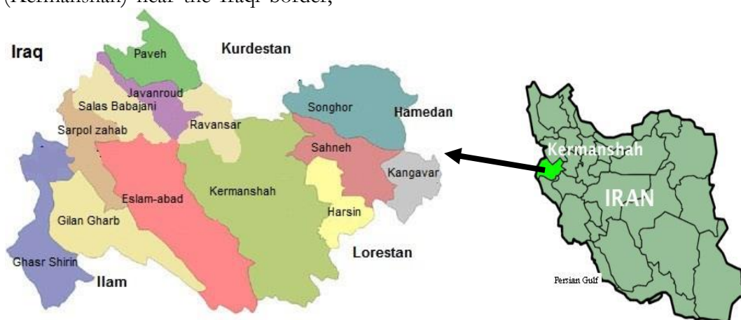
Fig .1: Location of Kermanshah Province within Iran and studied areas

Because of the importance of CL in this province and slightly increasing of disease in recent years, this study was designed to assess the status of CL from 1991 to 2012.