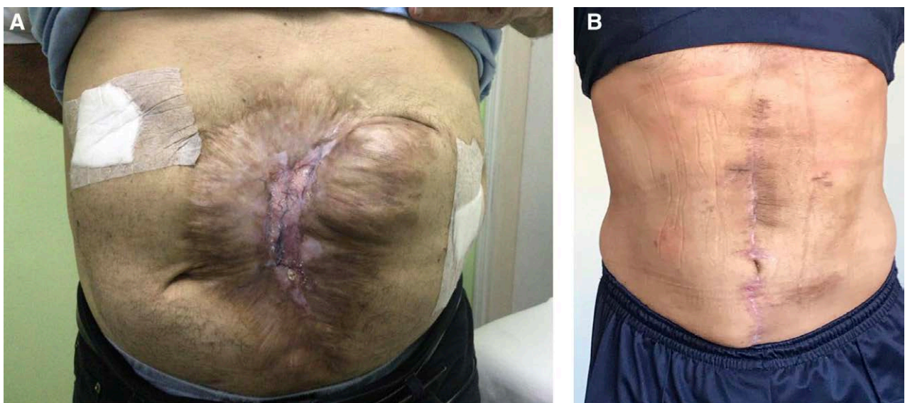
Fig. 2. A 56-year-old man with a 25-cm wide incisional hernia in the midline. Two flaps were dissected. A, Preoperative image. B, Postoperative image.