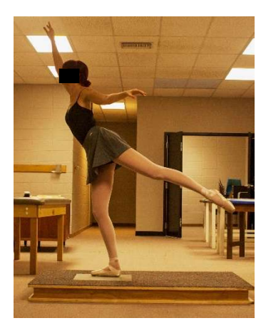
Figure 7. Jump landing in plié on the force plate for sauté arabesque.

Participants warmed-up by performing static stretching and dynamic movements and were allowed to practice all jumps prior to data collection. Jump landings resulting in stumbling, touching down with the non-weight bearing leg, or incorrectly executed were repeated. In each ankle support trial, participants were randomly assigned and performed three ballet movements and jumps that ended in a single-leg landing on the dominant leg for a sauté arabesque (Figure 7), sissonne ouverte de côté (Figure 8), and sissonne ouverte (Figure 9). All jumps were performed in pointe shoes. All jumps were performed facing a mirror to provide visual feedback and simulate common training practice [22]. Arm positioning was standardized for each jump. All jumps began off the force plate and ended with a single-leg landing onto the center of the force plate. Upon landing, the participants were instructed to stabilize as quickly as possible and remain motionless for 10 s.