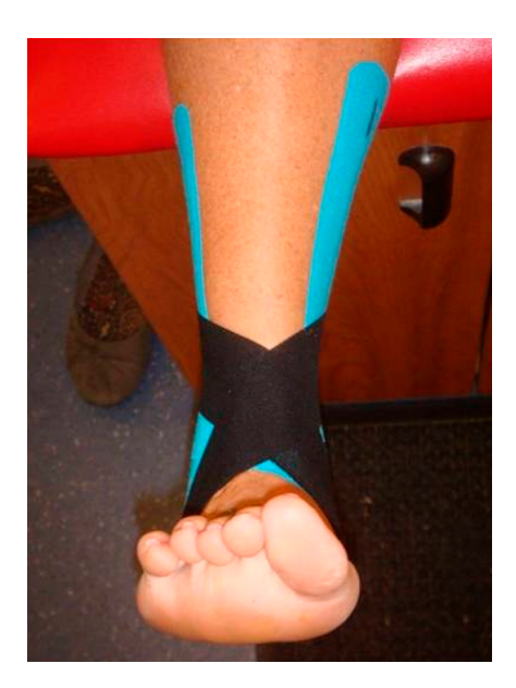
Figure 6. Anterior view of the third strip of Kinesio tape.