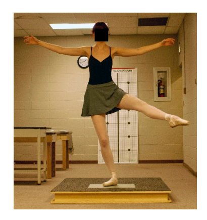
Figure 8. Jumping landing in plié on the force plate for sissonne ouverte de côté.