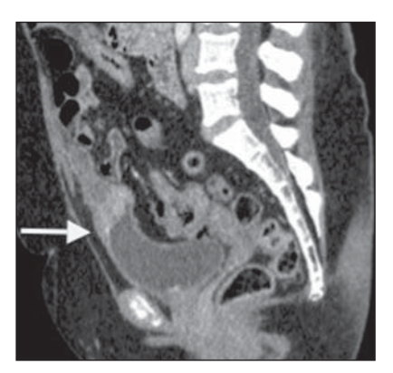
Figure 3. Computed tomography, sagittal reconstruction showing urachal remnant and expansile lesion on the midline of the meso hypogastrium region, with heterogeneous contrast enhancement on the transition point between the bladder and the urachus (arrow).