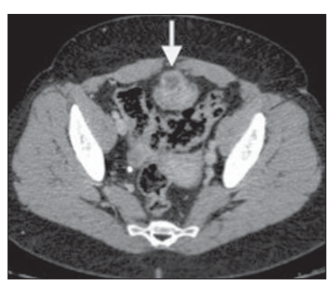
Figure 2. Computed tomography, axial section showing urachal remnant and a mass with soft parts components with heterogeneous contrast enhancement in the meso hypogastrium region at the anterosuperior midline for the apex of the bladder (arrow).