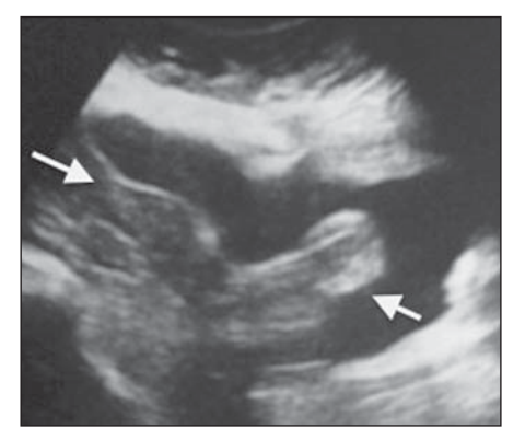
Figure 1. Ultrasonography, sagittal plane showing the presence of a remnant urachus and expansile, heterogeneous and irregular lesion (between arrows) at the midline of the meso hypogastrium region on the posterosuperior bladder wall.