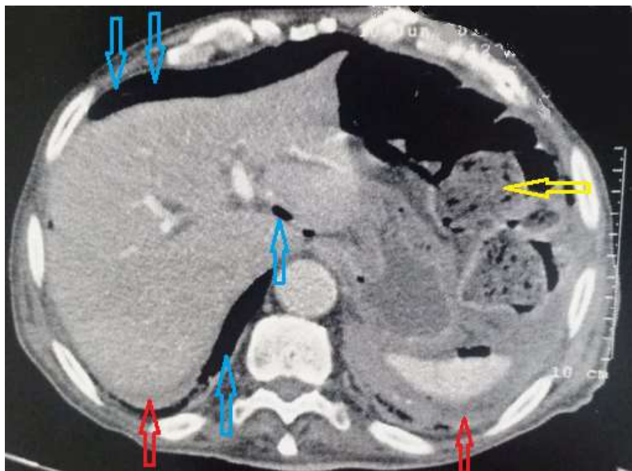
Figure 1: abdominal CT revealing pneumoperitoneum (blue arrow), and moderate free fluid (red arrow), and fecal impaction of the large bowel (yellow arrow)