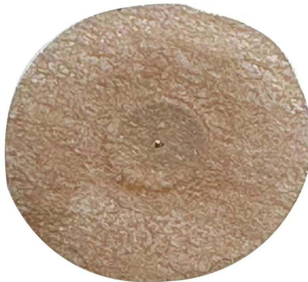
Figure 3 Sham intradermal acupuncture.