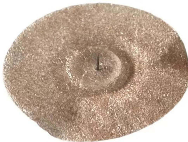
Figure 2 Active intradermal acupuncture.

The primary outcome will be evaluated prior to the initiation of the intervention, as well as at the 3-week, 6-week, and 10-week follow-up mark.