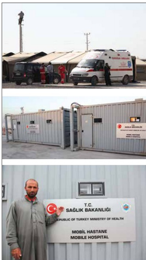
Figure 5: Camp management, security, logistics and distribution centers and mobile hospitals were located centrally within the camps.