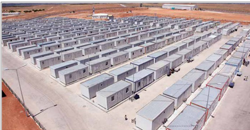
Figure 3: A typical refugee camp erected for Syrian refugees.

procedures conducted at secondary receiving hospitals and 20,443 operative cases in tertiary centers. There were also 140,968 regular and 3647 high-risk deliveries performed. Among this population, there were 4882 deaths recorded in secondary hospitals and 1396 in tertiary centers.