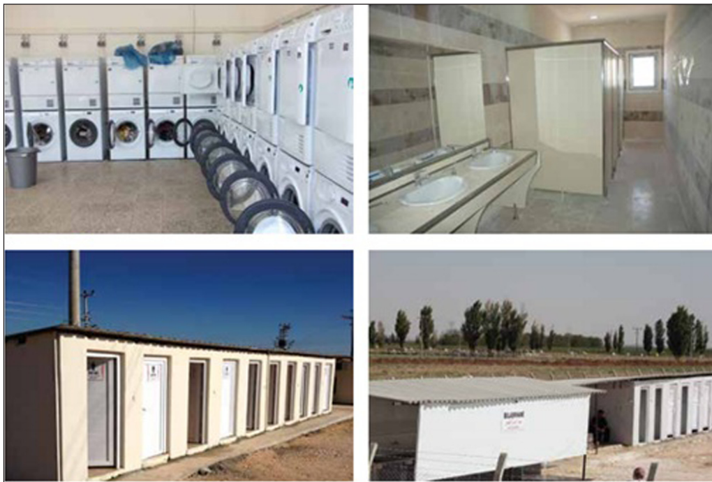
Figure 4: Refugee camps in Turkey, also include separate bathing and laundry facilities for men and women.