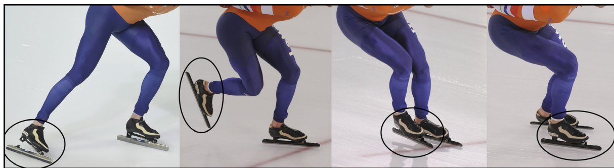
FIG. 1. One full gait cycle for a speed skater consists of a push, swing, skate placement, and glide phase. Skate placement is the precarious moment where skaters must shift their center of gravity over the alternate skate while placing it on its outside edge.

movement (degrees), and angular rate of change (angular frequency in rad/s) of the cramp movement.