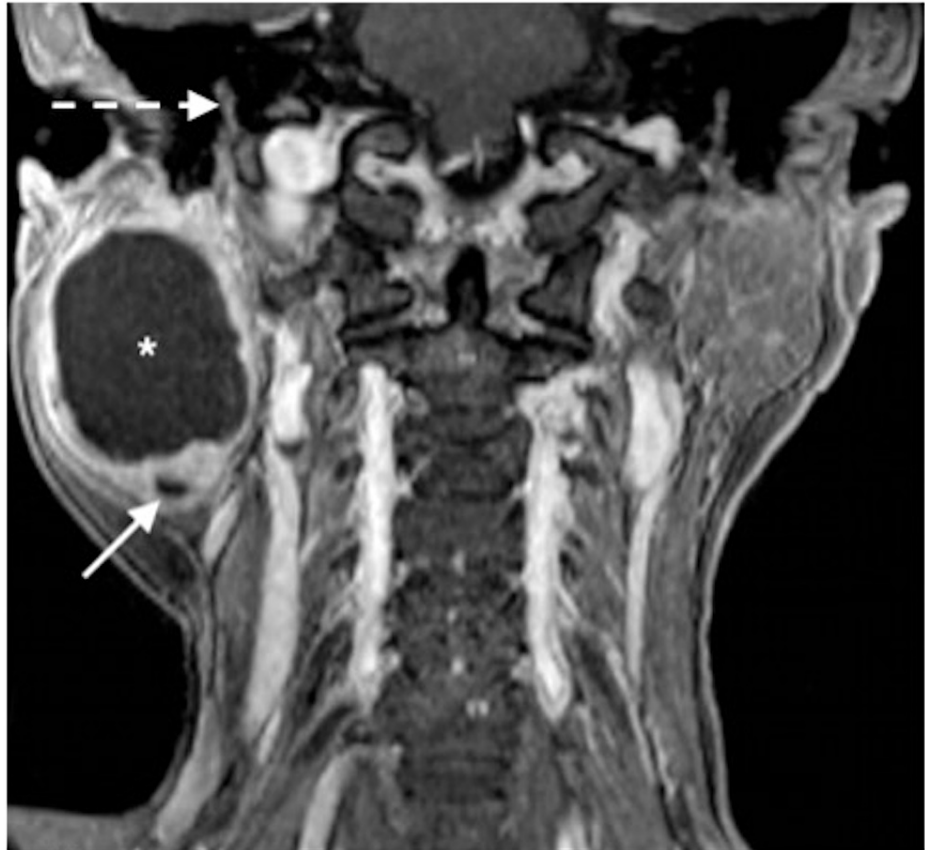
FIGURE 2: T1 VIBE fat-saturated image.

In a post-gadolinium image, the peripheral solid component enhances, surrounding the central non-enhancing hypointense cystic component (*). A smaller cyst (arrow) is also noted within the peripheral solid component. Note the normal mastoid segment of the right facial canal (dotted arrow) in relation to the parotid lesion.