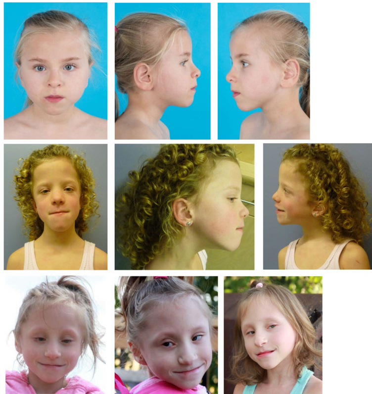
Fig. 1 Photographs of (from top to bottom) patients 1, 3, and 4 with de novo truncating ZNF148 mutations. Note common features like triangular-shaped face with pointed chin and wide-set eyes

abnormal telencephalic midline patterning, or abnormal axonal growth or guidance (reviewed in [24]). Although over 50 genes have currently been linked to MCC [24], none of these has clear overlap with ZNF148 with regard to biological function or the cellular pathways they are involved in. In addition, the clinical phenotype of our patients is different from known syndromes in which MCC is a feature [24]. We thus postulate ZNF148 as novel genetic factor required for corpus callosum development.