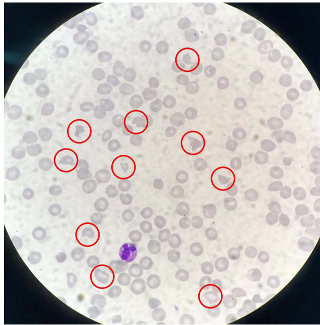
Figure 1 Schistocytes found in the peripheral blood smear on 2022-10-11 (in the red circle).

testing on 2022-10-12 to determine ADAMTS-13 activity and its inhibitor. The test results came back the following day, showing that ADAMTS-13 activity was 0% and ADAMTS-13 inhibitor was positive. The diagnosis of iTTP was clear.