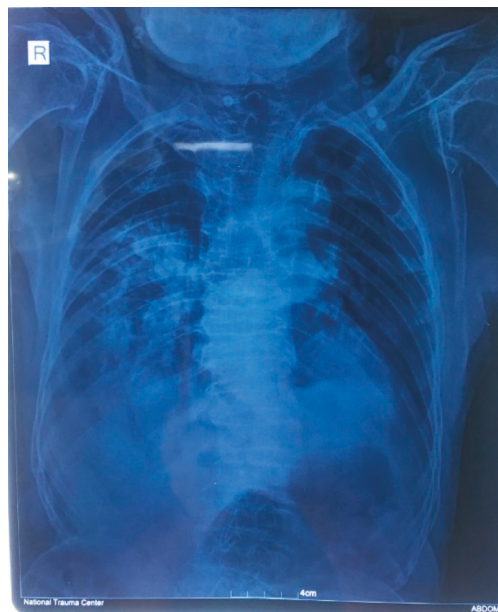
FIGURE 2: Chest X-ray.

all visible intervertebral discs. A dorsolumbar scoliosis with cervico-dorsal-lumbar spondylosis was also noted.