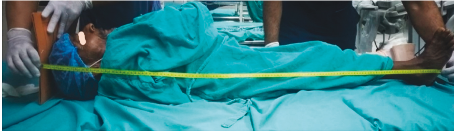
FIGURE 3: Short stature of the patient.