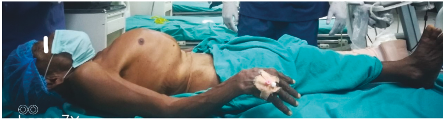
FIGURE 4: Obvious chest deformity.

rating scale for positional pain was 3 out of 10. With the help of a paediatric Tuohy needle, the dura was punctured at 3 cm depth and free flow of the cerebrospinal fluid (CSF) was observed. Then, a paediatric epidural catheter 22 gauge was inserted and fixed at 6 cm. Backflow of CSF was checked, and 0.4 millilitres (ml) (2 mg) of hyperbaric 0.5% Bupivacaine was administered over a minute. The effect of spinal anaesthesia was confirmed on the patient's normal leg. Approximately after eight minutes, the level of sensory block reached T8. Surgery was then allowed to commence as the motor blockade measured by the modified Bromage score reached 2. During the two hours of surgical duration, a single episode of hypotension was noted which resolved with fluid bolus. Based on the assessment of block height regression, the patient received further three aliquots of 0.4 ml of hyperbaric bupivacaine. So, the entire procedure was completed with 8 mg of 0.5% hyperbaric bupivacaine. We removed the catheter in the postoperative unit after infusing another 0.4 ml of hyperbaric bupivacaine. The catheter was removed as the expertise to handle CSA in the postoperative ward was inadequate. The patient was discharged from postoperative care after 24 hours of uneventful stay.