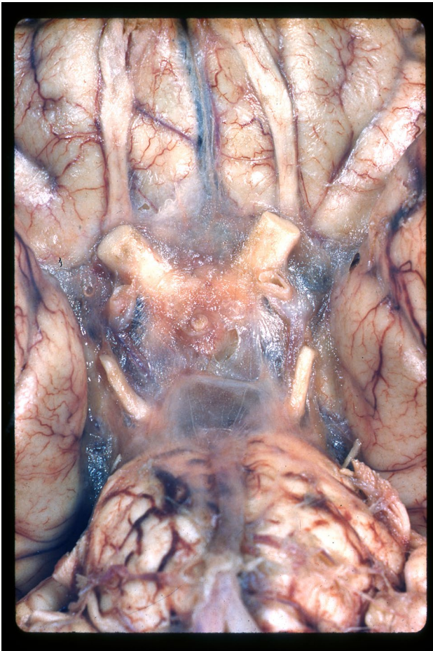
Fig. 1 Opacity of the subarachnoid space around the optic chiasm due to edema associated with Cryptococcus neoformans

sparrows, and skylarks [2]. The association between Cryptococcus neoformans and nervous system infection was first described by von Hansmann in 1905 [3].