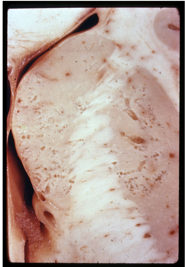
Fig. 2 Cystic changes within the basal ganglia on the left side due to Cryptococcus neoformans

Three distinct groups of at risk individuals were identified by the Infectious Diseases Society of America (IDSA): those who are HIV positive, immunosuppressed recipients of organ transplants and a final heterogeneous group of HIV-negative/non-transplant patients [5, 6]. Although immunocompromised individuals are more susceptible to cryptococcosis, paradoxically, non-immunocompromised individuals often have a more severe clinical course [1]. Cryptococcosis is not a rare disease globally with the highest