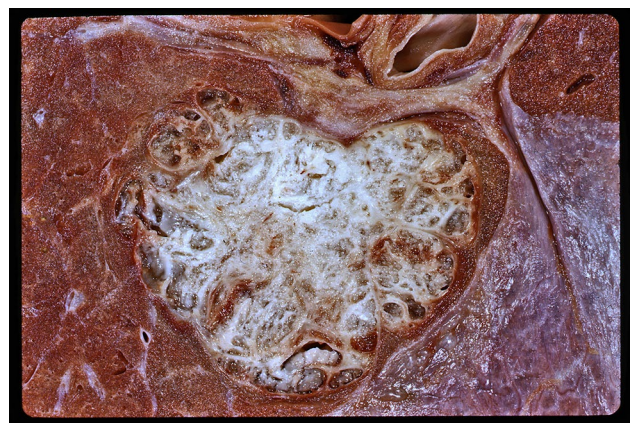
Fig. 3 A 'toruloma' of the upper lobe of the right lung showing fibrous trabeculae separated by gelatinous parenchyma caused by pulmonary infiltrated by Cryptococcus neoformans

number of deaths recorded each year in the first decade of this century being approximately 600,000 [7]. More than 1 million cases of Cryptococcus neoformans infections have been detected in AIDS patients annually [8]. Cryptococcal