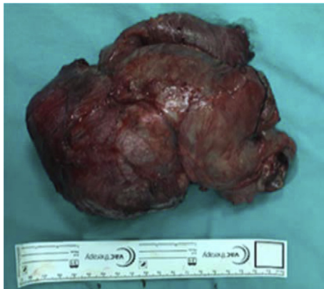
Fig. 2. Intraoperative photo of undescended testis tumor after partial small bowel resection.